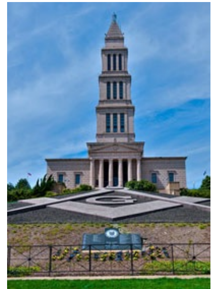
George Washington Masonic National Memorial in Alexandria, VA

Much speculation exists about the role Masonry played in the founding of our country. From founding